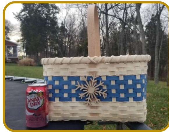
F3 Let It Snow Nichole Hutchins (6 HR)

Woven on a 5x14 D shaped handle, Let It Snow is a fun and easy to weave with start/stop style and twining. Adorable snowflakes are added onto one side of the basket. Focus on shaping to prevent peanut/rounded sides will be the focus on this creation.