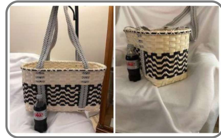
T12 Classy Chevron Linda Elschlager (8 HR)

Beginner/Intermediate D 10" H w/o Handle 6" $50 (K 50)