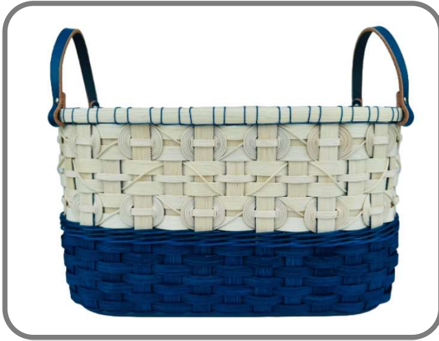
T7 Crater Lake Mary Price (8 HR)

This Royal Blue basket was inspired by a visit to Crater Lake National Park, where the water's deep blue color was mesmerizing. This basket mirrors that stunning shade woven using a slotted wood base, spokes, and weavers, all in royal blue. Learn triple twine with a step up and how to transition from the solid blue bottom half to the natural reed of the top half with overlay techniques. Final embellishments feature blue leather handles attached to a blanket-stitched rim and two rows of Cherokee wheels added to the finished basket