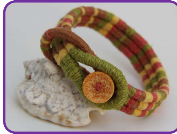
F15 Coiled Linen Bracelet Maria Tinnell (3 HR)

All Levels Average Size of Loom is 6 x 8, (other sizes available) $60