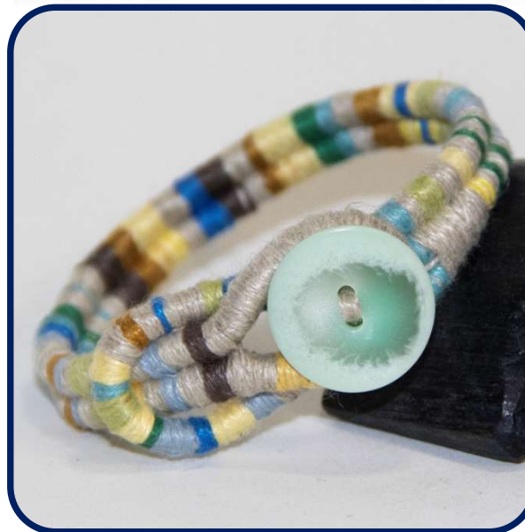
S15 Coiled Linen Bracelet Maria Tinnell (3 HR)

Participants will have hands on experience learning how to create a coiled linen bracelet, add or change colors, create a pattern of their choosing and learn variations on stitches, and finish the end. . Materials included: linen thread, nylon cord and tapestry needles as well as a button or bead for the closure.