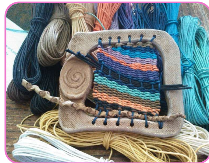
S10 Pottery Meets Fiber (3 x 5) Cheryl Dixon (2 HR)

I make the pottery looms from high fired clay and then they are woven with a variety of "soft" and "hard" materials. Techniques include basic over and under weaving, twining, arrows twining, ti-twining, and turning back. Natural materials will also be available for weaving. Students may provide their own special yarns, beads or other things they may want to incorporate into their masterpiece.