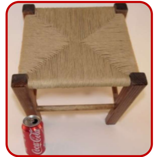
T2 Rush Foot Stool Steve Atkinson (6 HR)

Support all of our wonderful Vendors!! Remember there are no shipping fees at Convention, so stock up!!