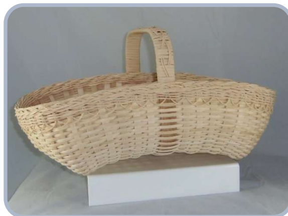
F4 Scalloped Cat Pam Milat (8 HR)

Beginner/Intermediate W 9.5" L 18" H 9" w/h 13" $75 (K 75)