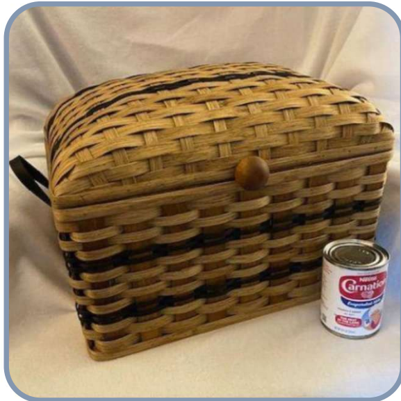
F12 Treasure chest Linda Elschlager (12 HR)

This class is a two-day class. This beautiful chest is woven over a wooden frame with slats. It is accented with leather side handles. Please note that rims will be brads and nailed onto both the lid and bottom frame. Length of time to complete this project is dependent on how much time is needed per student, with the help of the teacher, to complete the lid and rimming process. Color choices will be available at class time.