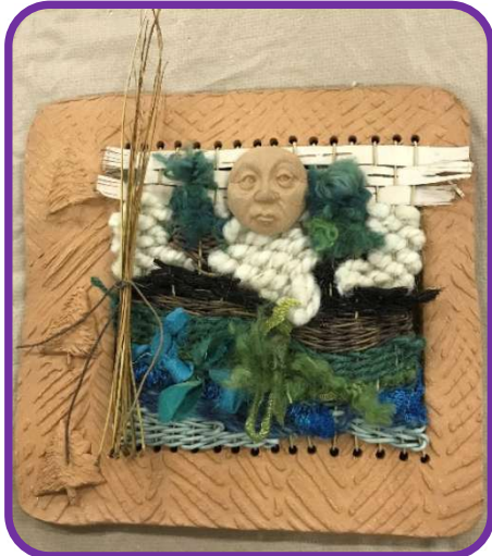
F10 Pottery Meets Fiber (6 x 8) Cheryl Dixon (4 HR)

All Levels W 15.5" L 32" H 18" $95 (K 95)