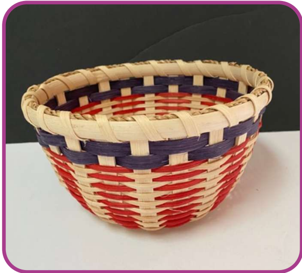
S11 Red, Blue & Natural Bowl Sandy Bulgrin (4 HR)

Get ready for summer time decorating with this red, white, blue bowl: this wood base basket is woven with natural reed along with dyed reed of red and blue. Perfect for your Fourth of July celebration and celebrations for years to come.