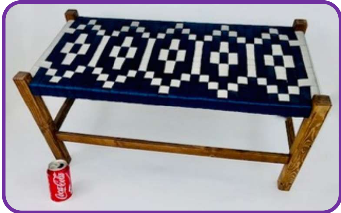
F2 Five Diamond Bench Steve Atkinson (4 HR)

New woven bench is great for the family, works well in living room, around a table or at end of bed. It takes two colors of 1" shaker tape or nylon webbing (lots of colors) will be brought to class. A feature of this bench is that a support board is completely hidden in the weaving process. The pine bench comes stained and varnished, ready to weave on. NOT TO BE USED AS A STEPPING STOOL.