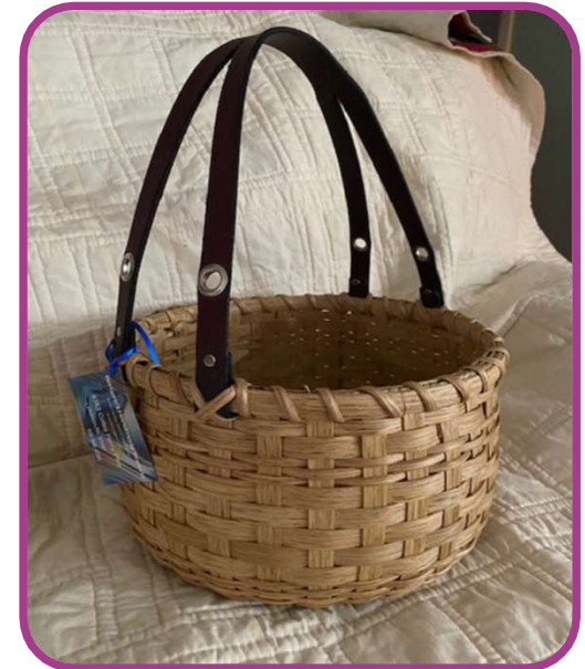
S6 Sunshine Yarn Basket Barbara Boone (4 HR)

This basket is made using a rounded effect instead of upsetting the spokes from the base. Learn to use FO reed produce a rounded effect. Basket is topped off with a pair of Amish handmade leather handles with grommets used to organize yarn.