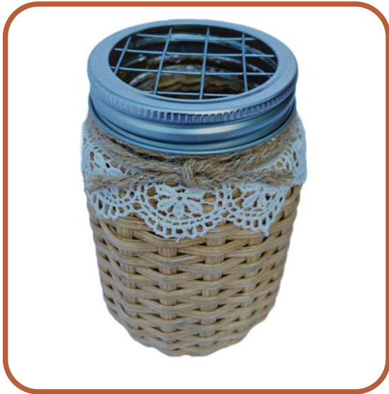
W7 Mason Vase Mary Price (2 HR)

The perfect gift for any occasion, this sweet functional vase starts on a round wood base. Students will learn to continuous weave around a pint-sized Mason jar. Emphasis is placed on tightly following the curved shape of the jar. Lace, sparkly jute, and a floral frog lid make this vase extra special.