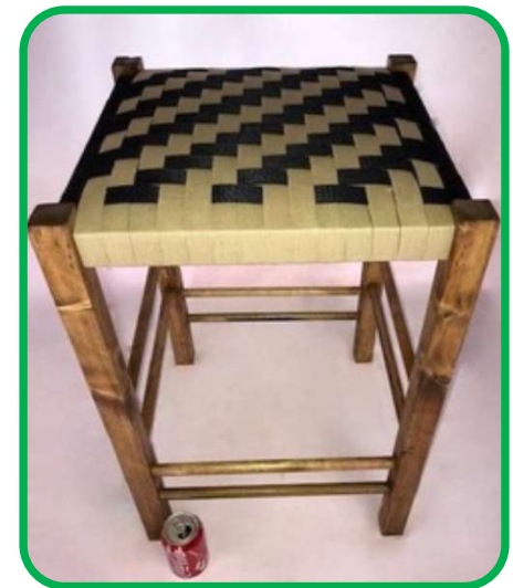
W2 Kingston Bar Stool Steve Atkinson (4 HR)

Barstool is perfect height for kitchen counter/high table. Woven with shaker tape and/or nylon webbing (large color selection). Includes foam padding and luan (board) for support. Stool is stained/varnished. Students choose 2x2 twill or checkerboard weave. Notify us 1 month ahead for different height, may be additional charge.