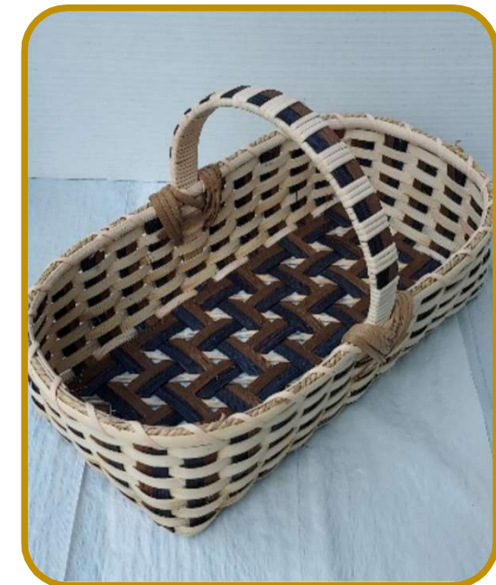
F5 Optics Gathering Basket Pat Mercer (6HR)

Intermediate W 7.5" L 7.5" D 7.5" H 3.5" $68 (K 68)