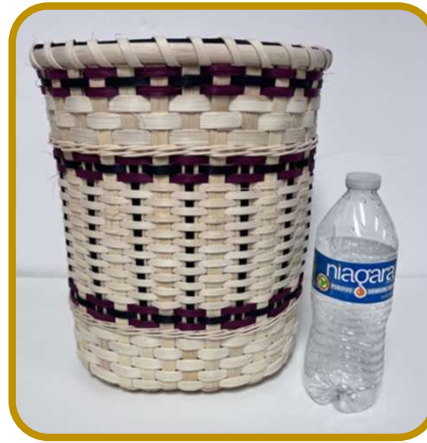
W11 Good Looking Waste Basket Sandy Bulgrin (6HR)

This basket starts on an oval wood base and is woven to about 11" high. Using natural and dyed reed students will weave this basket to fit a plastic liner, included. A great basket for bath or office. Dyed reed color choices will be available.