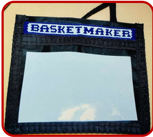
T13 Basket Weave Name Tag Holder Barb McNally (6 HR)

The Basket Weave name badge holder has a beaded strip made in odd count peyote stitch using 11/0 Japanese delica beads. The strip will be glued to the name badge holder when done. Teacher provides Ott lights for class.