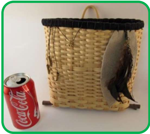
W1 Bear Claw Pass Wall Basket Sandy Atkinson (4 HR)

Using a cut branch as the base the spokes are divided to make the sides flare out, while forming the flat side for the wall basket. Woven with dyed and natural reed, a pattern is woven into the front of the basket for special effect. The leather rim is lashed with linen thread and comes with a bear charm, danglers, feathers, and leather. A self-made small handle is woven into placed at the center back for hanging.