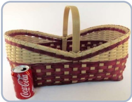
F1 Lexington Market Basket Sandy Atkinson (8 HR)

A market basket is perhaps the most useful basket. This one with slanted sides, filled in base, triple twining, turn back sides and notched handle will be used every day. Dyed reed is wine with brown. Handle will be sanded and lightly stained and varnished.