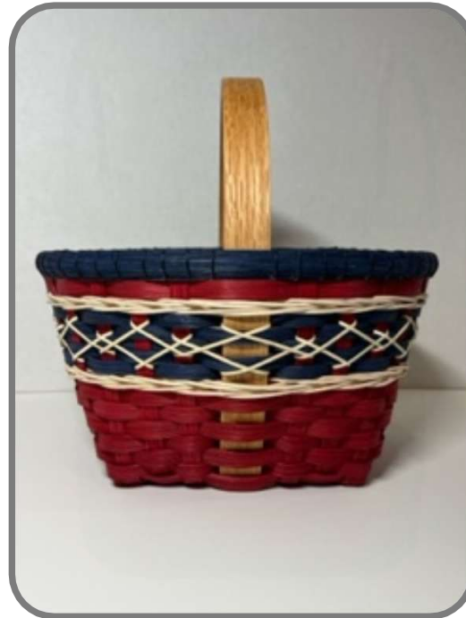
T8 Salute Jamie VanOekel (8 HR)

Intermediate W 7" L 15" H w/o handle 8" $85 (K 80)