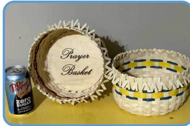
W3 Blessing /Prayer Basket Nichole Hutchins (3 HR)

Using basic stop and start weaving, students will create a basket to put their blessings and/or prayers in. It also makes a great gift for someone going through a tough time that just needs to know someone is in their corner. Finished with a matchstick ribbon top, this basket will be a quick weave and a blessing to receive. Bases will be available with either Blessing Basket or Prayer Basket engraved on them.