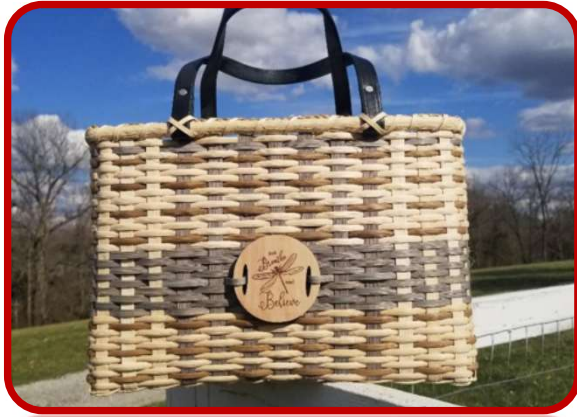
T3 Totes Adorbs Nichole Hutchins (6 HR)

This beautiful tote is great for lots of little things and a few big things such as going to the library, farmers market, teacher school bag and SO much more! The added disk gives your finished product a little personal touch. Final basket measures approximately 14x7x10 not including handmade Amish handles. Shaping will be a focus of this basket. Students will also be introduced to chase style of weaving. Rows will be woven in stop/start manner using a mix of flat and flat oval reed to help create the beautiful design. Kits will be precut and students will select their color at the time of the class