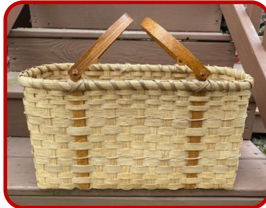
T6 State Fair Market Basket Barbara Boone (6 HR)

Advanced Beginner/Intermediate W 7" L 14" H 10" $75 (K 75)