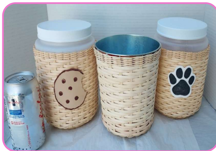
S5 Make and take Pat Mercer (2 HR)

All Levels Back/H 16" Seat W 9" Seat Depth 9.5" Seat H 8" $54 (K54)