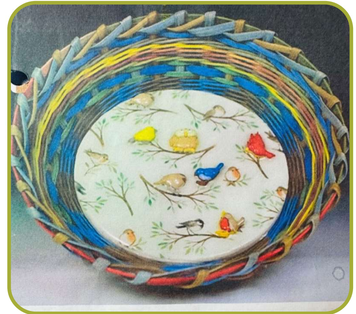
S14 Chubby Birds Earlene Krammer Lampman (6HR)

Chubby Birds was created by me on a 6" round base as a gift for a special friend. She photographed it and put it on Facebook and the rest is history. Every base is created, completed and resined by me. Students will have their choice of several of my six inch bases. This basket features triple twining, plus a 2/2 four rod wale for most of the basket and finished with a choice of rim techniques from a simple matchstick to a much more elaborate rim.