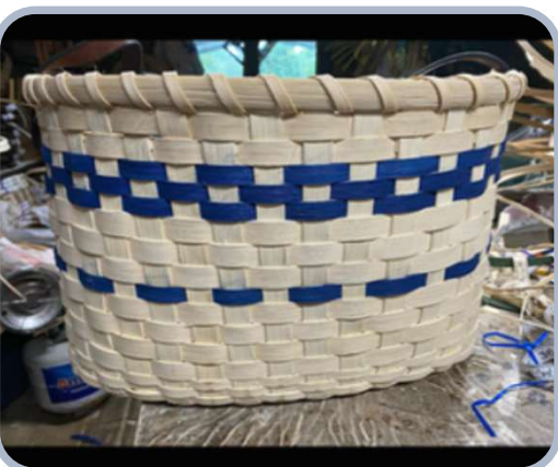
F6 Ashley's Tote Barbara Boone (8 HR)

Intermediate L 7" H w/o handle including lid 7" $60 (K 55)