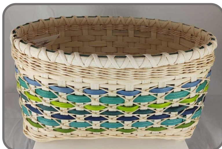
T4 Variations Pam Milat (8 HR)

Intermediate ½ --W 15" x 8.5" D 50" $65 (K 65) Full W 16" x 12.5" D 52.5" $85 (K 85)