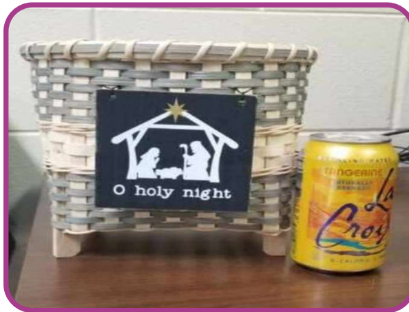
S3 O Holy Night Nichole Hutchins (4 HR)

A 7x7 open bottom serves as a base for this adorable addition to your Christmas decor. Created using start/stop weaving and twining, this is a great basket for your LED candles, greenery, Christmas cards or just something great to share with another as a gift. Legs and a sign saying O Holy Night are the perfect additions to finish off this basket.