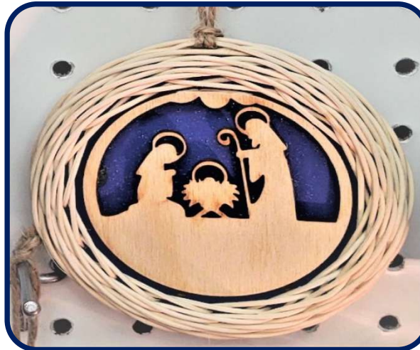
S4 Nativity Ornament Pam Milat (3 HR)

Students will weave a Gretchen Rim with natural round reed around a pre-drilled prepared ornament that depicts the nativity scene. Background colors may vary slightly as they are hand painted.