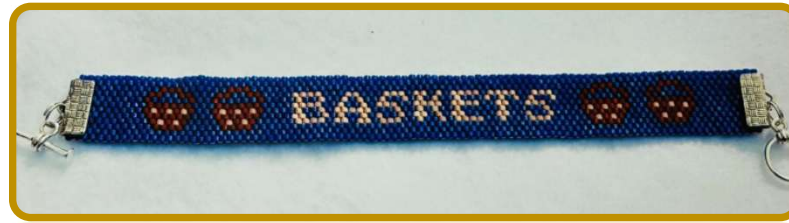
F13 Basket Bracelet Barb McNally (6 HR)

This colorful bracelet is done in even count peyote stitch using 11/0 Japanese delica beads. Bracelet will be finished with sterling silver crimp bars and clasp. Teacher provides Ott lights for class.