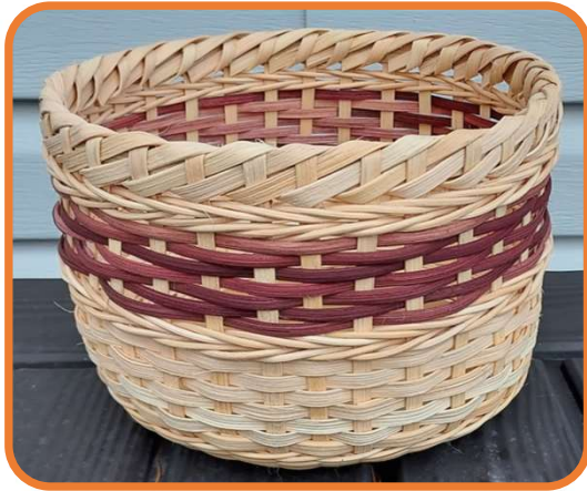
W5 The Sample Life Pat Mercer (5HR)

This basket incorporates patterns and textures in a cohesive design. It's started on a 6" round wooden base, stands about 6" tall and is about 8" in diameter. Techniques include chase weaving, twining, twilling, triple twining, continuous over/under weave, reverse triple twining, and a rolled matchstick rim.