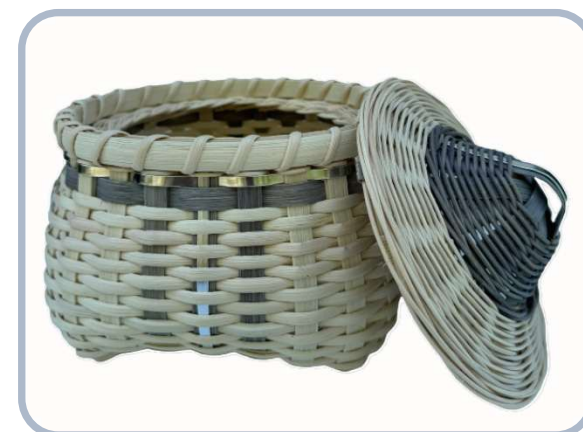
F7 Pagoda Mary Price (8HR)

Intermediate/Advanced W 8" L 16" H 7" $90 (K 90)