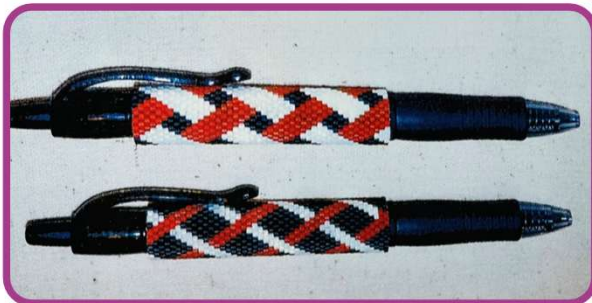
S13 Beaded Pen Cover Volume 1 Barb McNally (4 HR)

Show everyone you are a basket weaver when you sign your name. Students will choose one of two designs for a refillable ink pen cover. 1/0 delicas are used in an even count stitched panel. Teacher provides Ott lights for class