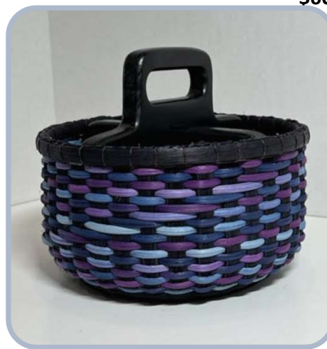
F8 Handy Quade Swirl Jamie VanOekel (8 HR)

All Levels W 6" L 14" D 42" H 12" $75 (K 75)