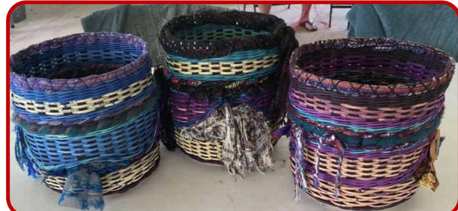
T10 Fun Funky Fibers Cheryl Dixon (6 HR)

Base is a 6" round and woven without a mold. It's a fun funky basket that can take on many shapes, you will control and design the weaving on the sides and the shape. Incorporates the following techniques but not limited to the following: Twining, triple twining, turning back, stacking, ti-twining, matchstick border option, using recycled fabrics and yarns to make some interesting landscaping.