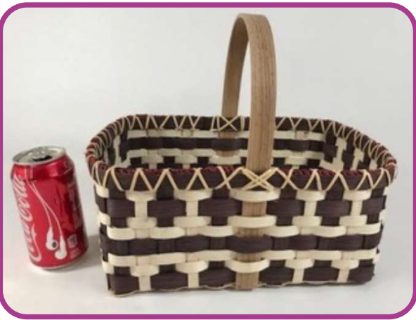
S1 Buffalo Plaid Market Basket Sandy Atkinson (4 HR)

A nice size market basket to carry anywhere or hold whatever. A basic beginner pattern woven in natural and dark brown reeds, with a pretty pattern on the base. Lashed with cane, D-handle, twining around base.