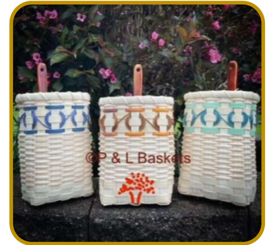
W12 Mammy's spoon Basket Linda Elschlager (6HR)

This utensil basket has a filled woven bottom. It is woven up the sides with a start/stop row of weaving. Color accents are added with the finishing touch of matching wheels. Your handle is a wooden slotted spoon. This is an easy and fun weave.