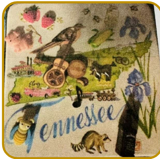
F14 Love My State Earlene Krammer Lampman (6 HR)

All Levels W 8" L 8" H w/o Handle 1.5" $50