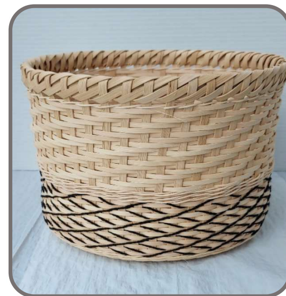
T5 Over The Waves Pat Mercer (8 HR)

Students will have a template to help lay out the spokes on an 8" round base. After chase weaving, twining and triple twining, this basket showcases wave weaving with macramé cord. Beneath the twilling level, students will have their choice of weaving 2 rows of triple twining or a row of triple twining and a row of reverse triple twining, forming arrows. A rolled matchstick rim caps off this basket. Several choices of macramé cord colors will be available in class.