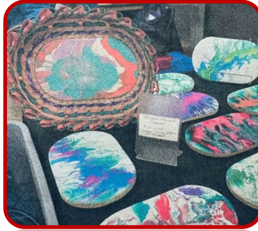
T14 Weave With Acrylic Poured Base Earlene Krammer Lampman (6 HR)

Students will choose their oblong poured base and weave a basket using traditional weaves. Students can choose beads and yarn to enhance their creations.