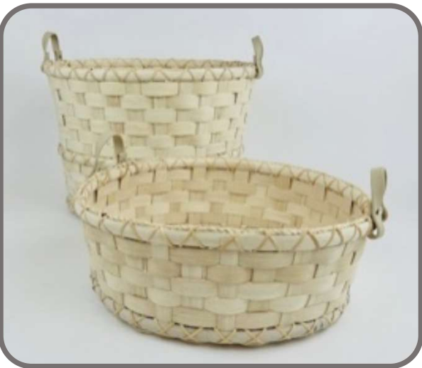
T1 Full/Half Bushel Basket Sandy Atkinson (8 HR)

Student chooses either the Full Bushel or 1/2 Bushel Basket (must indicate on registration their choice). Fashioned after baskets used years ago, these baskets will give you years of service as they are very sturdy made with base rims, top rims and a center rim on the Full Bushel and double base supports. Leather side handles worked into the rims for easy transport. A yard or garden basket made to be used.